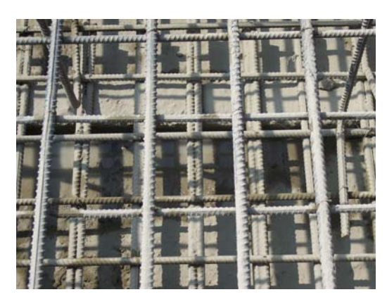
Construction site St. Mina Church